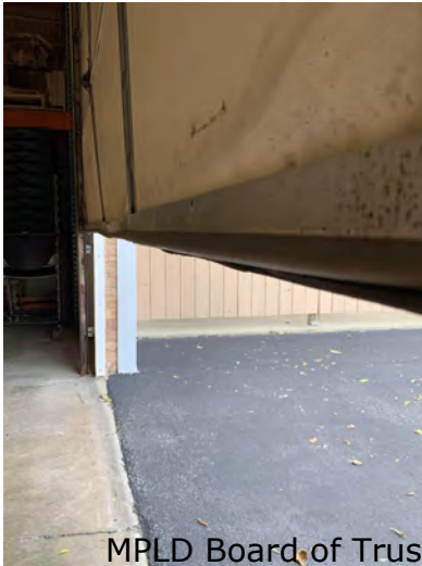
#7 Deformed v-channel