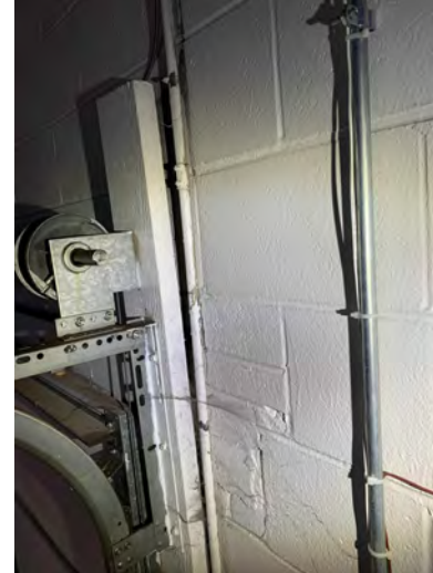
#8 Running board separation from block wall @ 45 degree bend on right side Upright track.