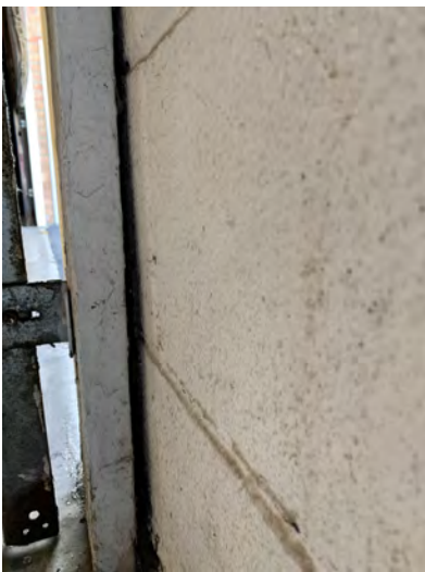
#5 Running board separation from Block wall. (faulty Concrete Lag)