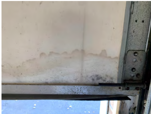
#2 Paneling leakage above Threshold Gasket