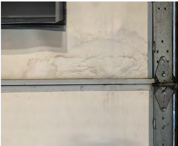
#1 Paneling leakage under mail drop box