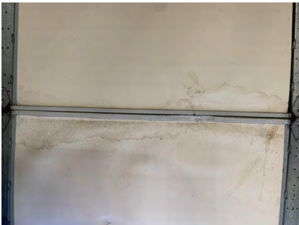
#3 Paneling Leakage mid door