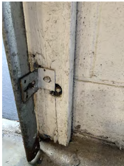
#4 Running board split on right side base